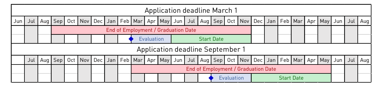
Lifecycle of the Pioneer Fellowship Deep-Tech Incubation Program Appendix 5

The following graph illustrates the relation between the application deadline, the applicants' graduation date or end of employment and the start date of the Pioneer Fellowship Deep-Tech Incubation Program.